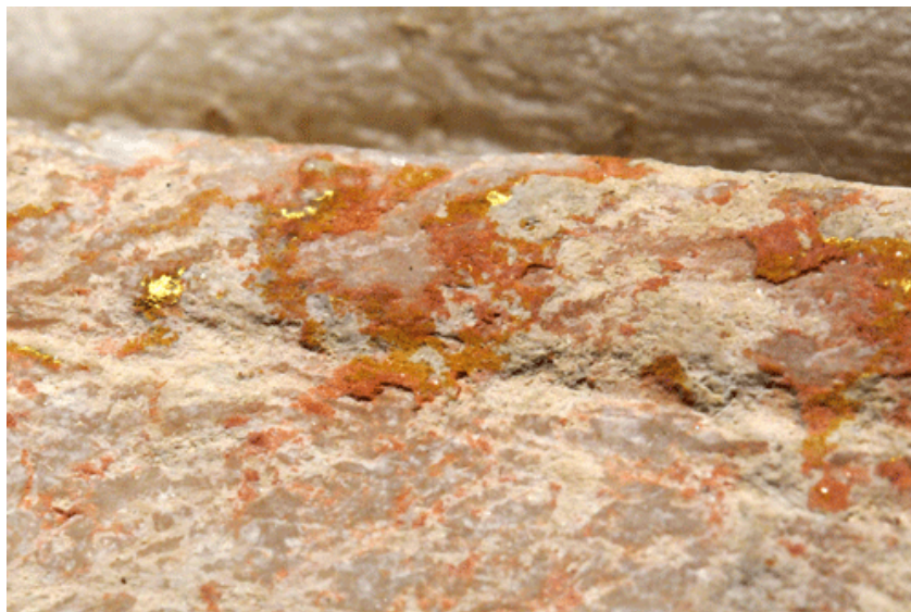
Ill. 2. Female portrait statue, Ist. Arch. Mus. 2269. Upper right: detail view the edge of the himation below left hand. The pink painting, the first phase of coloration, is covered with the yellow pigment and gilding of the second phase of coloration. Lower center: angled view illustrating the microstratigraphy of similar coloration on the himation along right side of the portrait head.