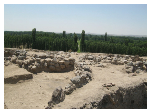
View of Area B, Medieval Levels

a paper on this material that will be published as part of a volume resulting from the 2013 medieval archaeology conference at SUNY Cortland.