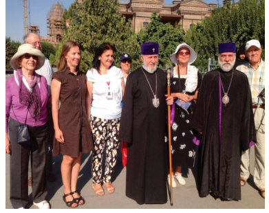
FARIT group with His Holiness Catholicos Karekin II in Echmiadzin

lisi itself. The highlights of the trip included visits to numerous medieval churches and monasteries in spectacular locations, the museums and cultural treasures of Yerevan and Echmiadzin, and the glorious vistas of the high country.