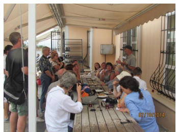
Introduction outside the excavation house