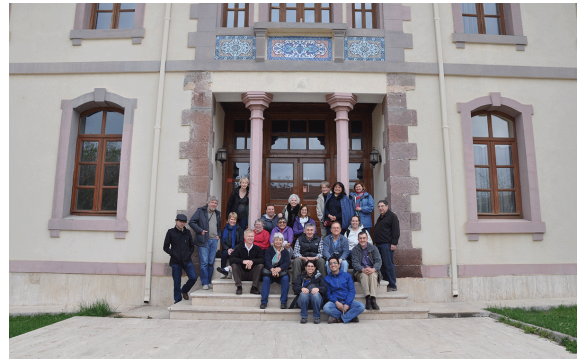
Ankara Friends at Abdülhamit II's revival project at Söğüt