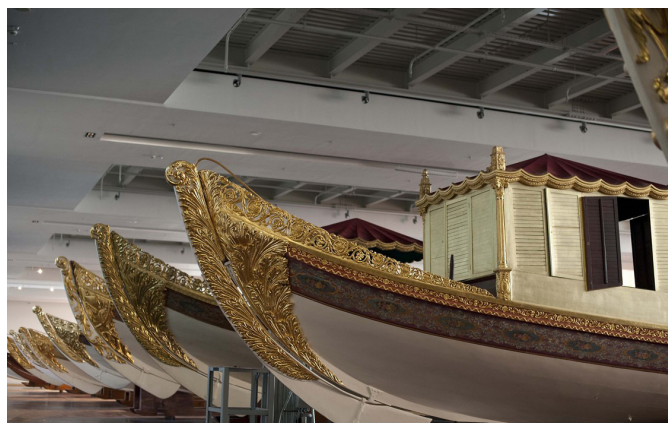
The Sultans' galleys in the soon to be re-opened Naval Museum.