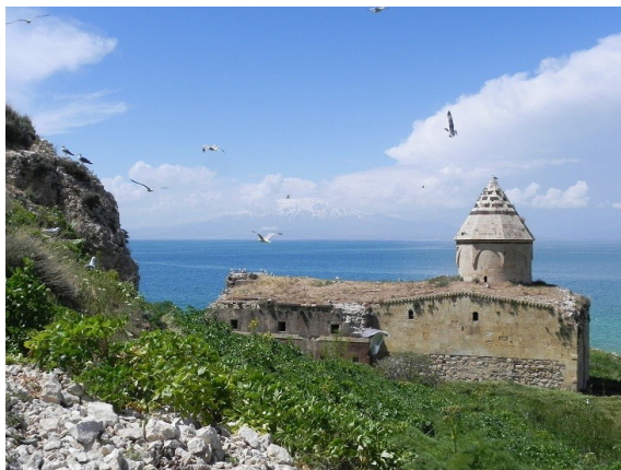
The monastery on Çarpanak guarded by sea gulls.