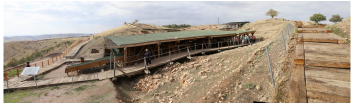
The new wooden structure built to protect the site at Göbeklitepe