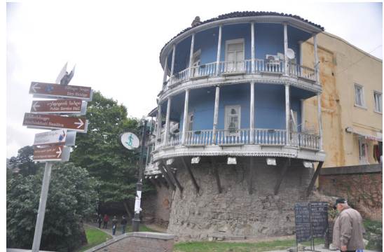
ARIT Ankara Friends visited Georgia