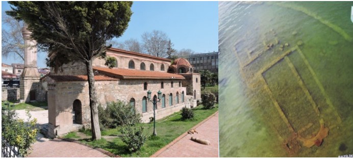
In İznik, the ‘restored’ Aya Sofya and the newly discovered underwater basilica