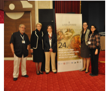
Museum workshop presenters and organizers