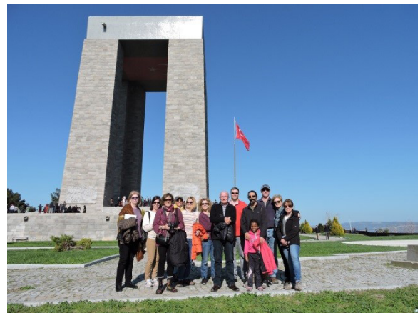
FARIT group in front of the Martyr’s Memorial