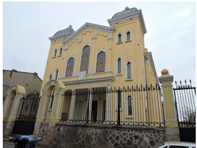
The newly restored synagogue in Edirne