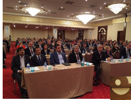
2015 Museum Symposium participants