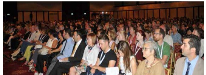
2014 Meeting of the European Association of Archaeologists