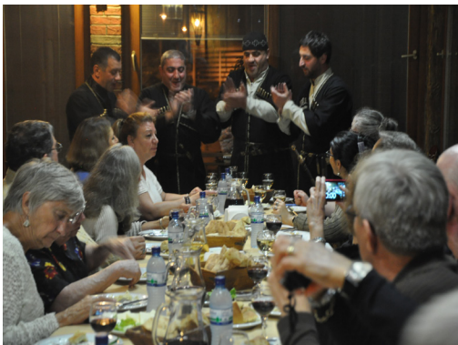
ARIT Friends dining in Tbilisi

In addition to the cultural heritage, the beauty and the hospitality of Georgia, the Friends discovered the variety and the depth of the culinary culture of Georgia , including amazing tastes of such dishes as badrejani, kachapuri and khinakali, which were naturally heightened with the smooth flavor of Georgian wine. We each had a chance to act as a tamada (a Georgian toastmaster), experienced the beautiful poetry of polyphonic drinking songs and watched a performance of lovely Georgian dancing.