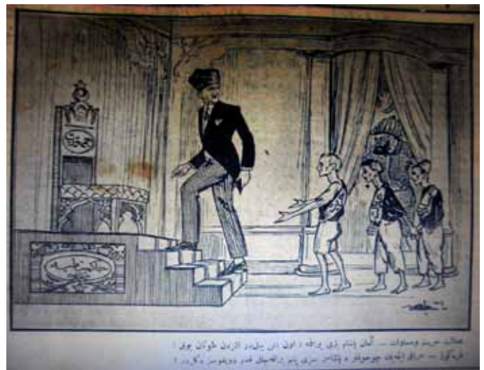
Akbaba , no. 288 (7 Sept 1925), p. 1. Atatürk Kitaplığı. Above: The dervish lodges, fictional stories, and superstitions are being demolished. Below: Young Turkey while opening the path to [modern] civilization...