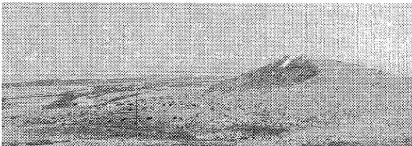
Figure 1. View of Kenan Tepe with the Tigris River in the background. Note the tents over the trenches.

UTARP began full-scale systematic archaeological excavations at Kenan Tepe during the summer of 2000. This research was made possible by generous support provided by the National Geographic Society's Committee for Research and Exploration, the American Philosophical Society, the American Research Institute in Turkey, and the University of Utah.