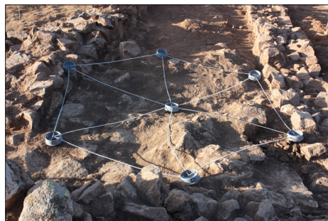
Sampling grid used to recover flotation samples at Kerkenes.