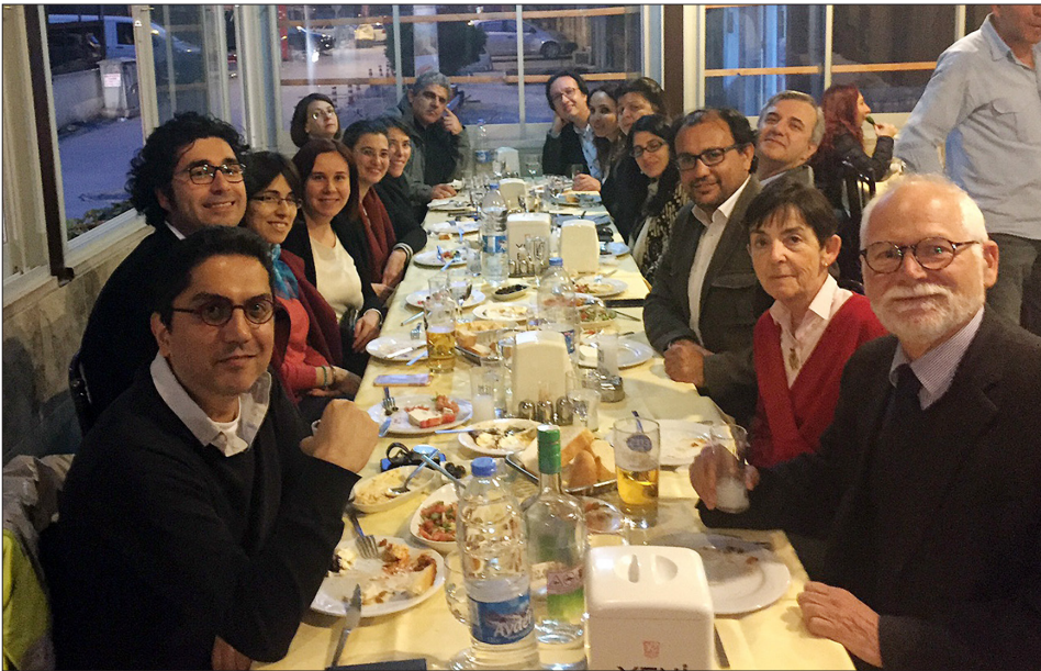
Hanfmann-Mellink Symposium meyhane.

hosted by İstanbul University's Archaeology Department in the spring of 2018.