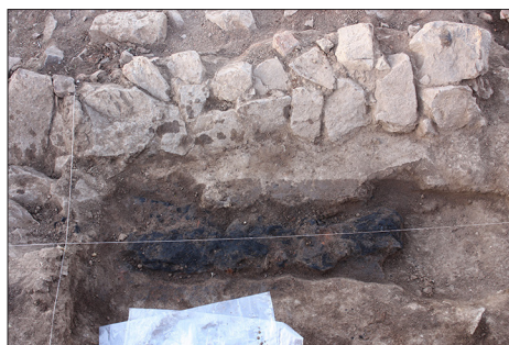
Burned beam from building collapse at Kerkenes; such finds were recovered intact and allow identification of construction practices.