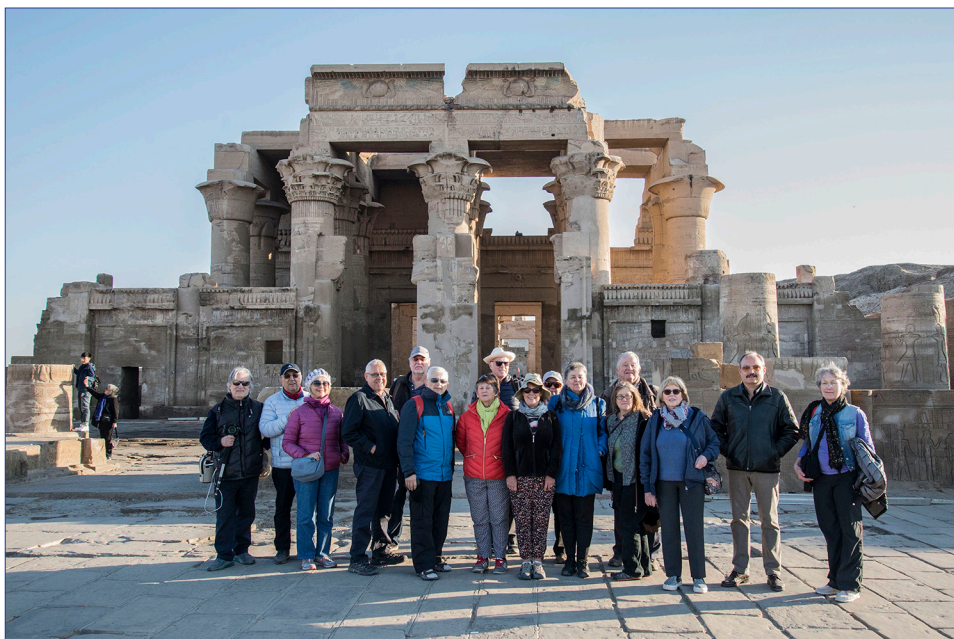
The Friends of ARIT in Egypt.