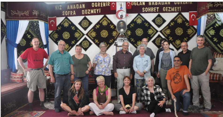
ARIT Ankara Friends visiting Kirşehir.