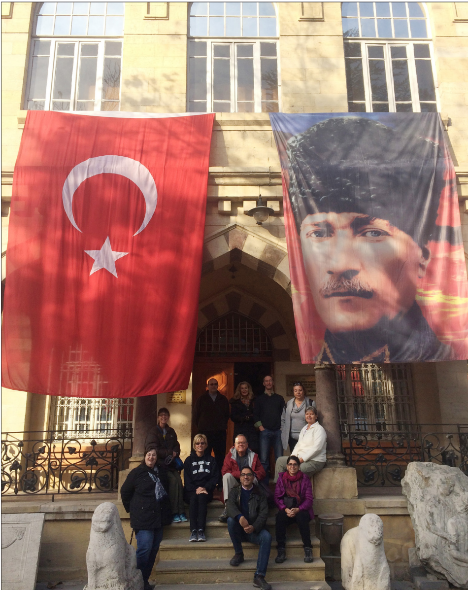
ARIT Ankara Friends in Kastamonu.