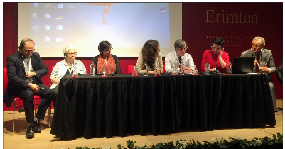
Conference speakers, Protection of Cultural Heritage in Emergency Situations .