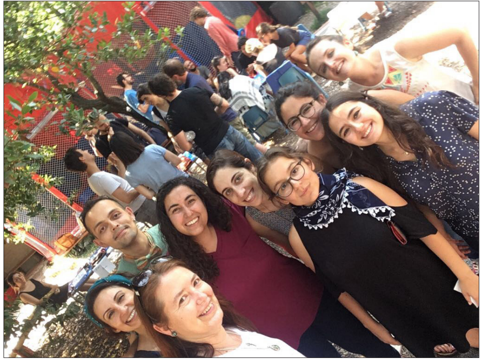
ARIT language program participants and director, summer 2017.