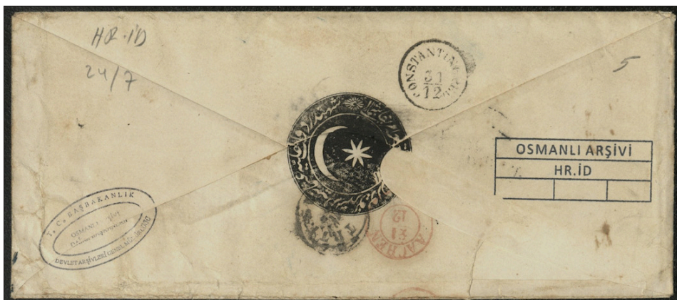
Envelope with seal, “Consulate of the Sublime Ottoman State in the City of New York, North America”, 1858, courtesy of Prime Ministry Ottoman Archives.

was devoted to researching my next book. Provisionally titled Ottoman Americana, 1776–1923 , this book project explores the social, economic, and cultural ties between the Ottoman Empire and the United States—as seen through the lives and writings of Ottoman consuls, entrepreneurs, migrant workers, and other kith and kin networks stretching from the Middle East to North America. Based on archival work in İstanbul and Ankara, and drawing from unpublished letters, manuscripts, and government records primarily in Ottoman Turkish, Arabic, and French, my research in Turkey pursued two overarching questions.