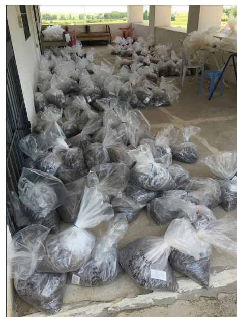
Botanical samples awaiting flotation processing at Kerkenes.