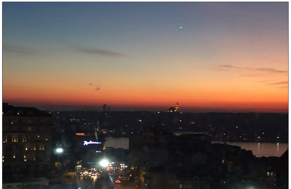
The view from Kallavi Sokak.

Perhaps the hardest part of this process was to accept that we could not afford to run a hostel any longer. Over the years the hostel has often been cited