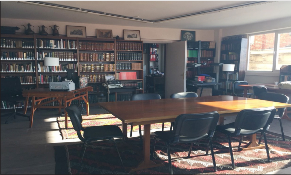
The reading room at Kallavi Sokak.

available for our own fellows and for American scholars in general. While I regret the loss of the hostel, I am hopeful this will be more than counterbalanced by the new possibilities for synergy that the new arrangement will provide. To give one quick example: by moving to ANAMED, we are now being accepted into the Biblio Pera Portal, which provides a single search engine for all the collections of the major research libraries in the city center. This should be an invaluable tool for visiting scholars.