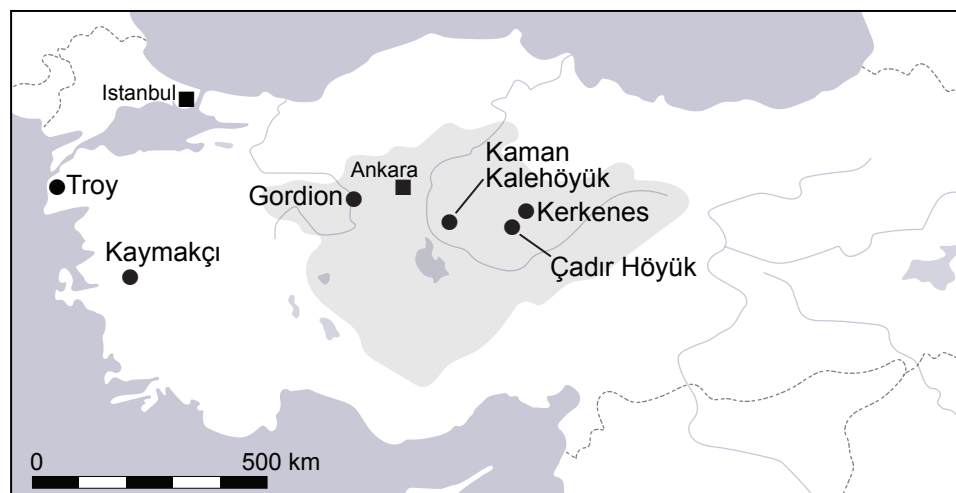
Map of Turkey indicating location of sites discussed in the text; shaded area is the central Anatolian plateau.

states provide a regional perspective on agriculture in central and western Anatolia that considers environmental and climatic differences within unified economic and political imperial frameworks. The data gathered during fieldwork in 2016, together with evidence from prior excavation seasons and published data from other contemporary sites in Anatolia (including Kaman Kalehöyük and Çadır Höyük), allowed me to identify agricultural practices and establish evidence for environmental stability or change across this region.