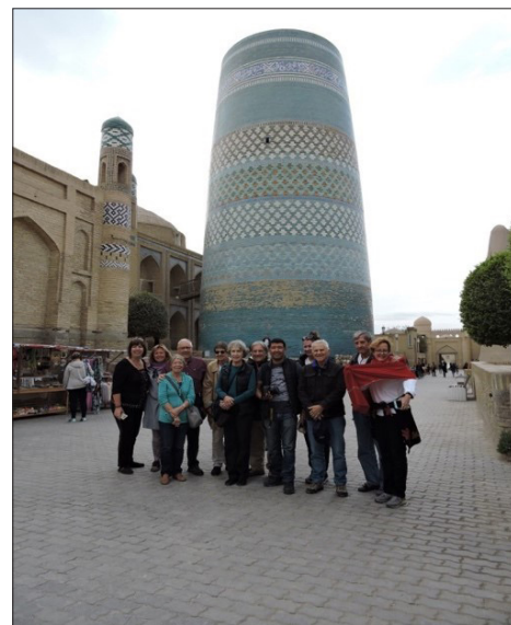
The Friends of ARIT in Uzbekistan.