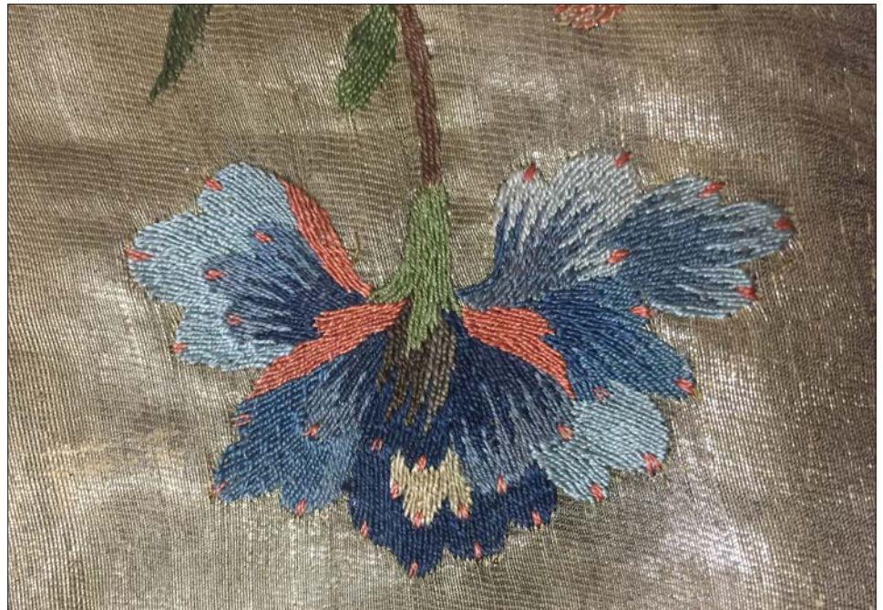
Detail of an Ottoman women's kaftan, 17th century, silk embroidery on cloth-of-gold.

Istanbul, of course, is the best place to work on this topic. The Topkapı Pal-