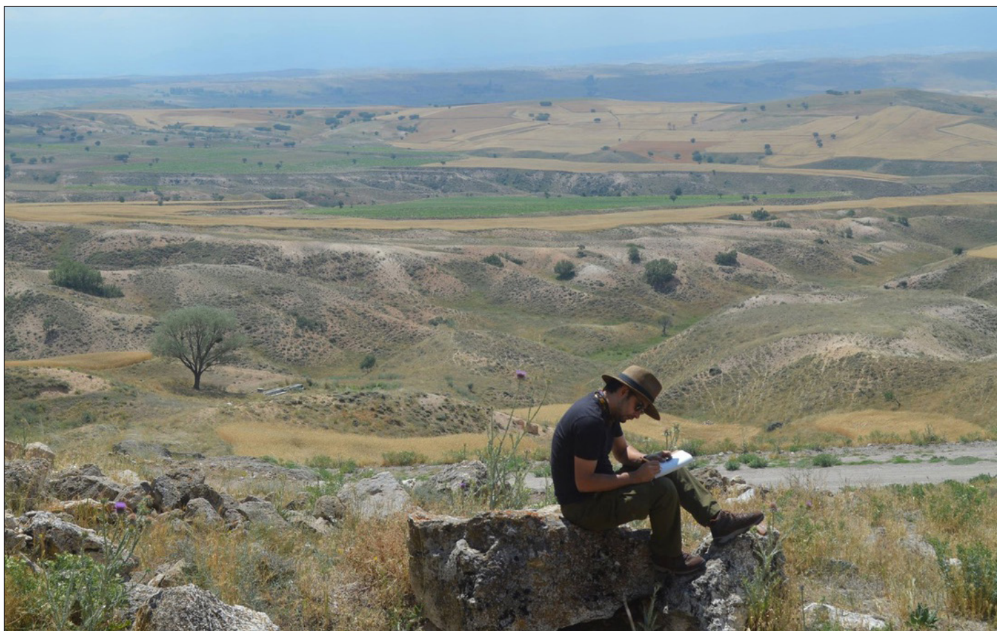
FARIT fellow Asil Yaman.