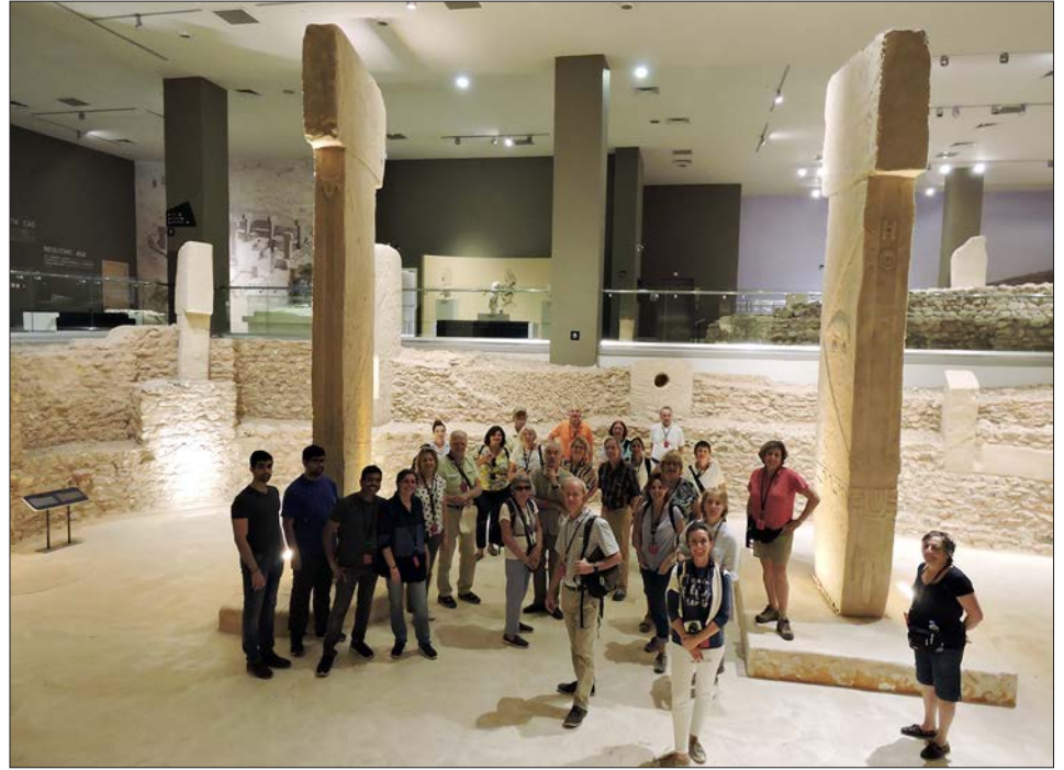
FARIT group gathered in the Göbeklitepe room of the impressive new museum in Urfa.