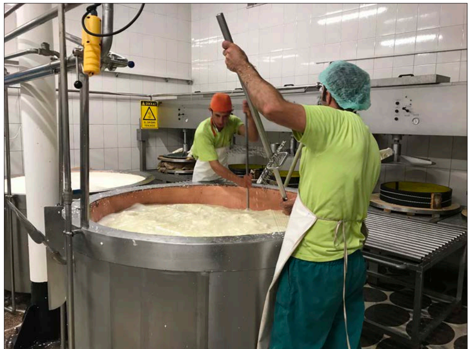
“Cooking” Gravyer cheese in Koçulu Mandıra, Boğatepe village, Kars.

I spent time in Gravyer Zavot (which means “production site” in Russian) and interviewed farmers about dairy farming and cheesemaking techniques. Gravyer cheese is produced only after the animals begin to graze in pastures after mid-April, and it lasts until mid or late August. When I followed the milk circulation from different villages to the three dairies in the village, I realized that all of the villages and pastures from which the milk is collected are above 2100 meters in the foothills of Boğatepe.