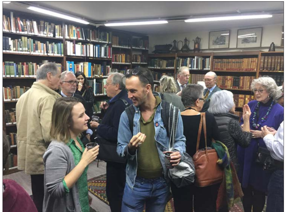
ARIT-Istanbul Friends open house reception after lecture on Kars artisanal cheeses.