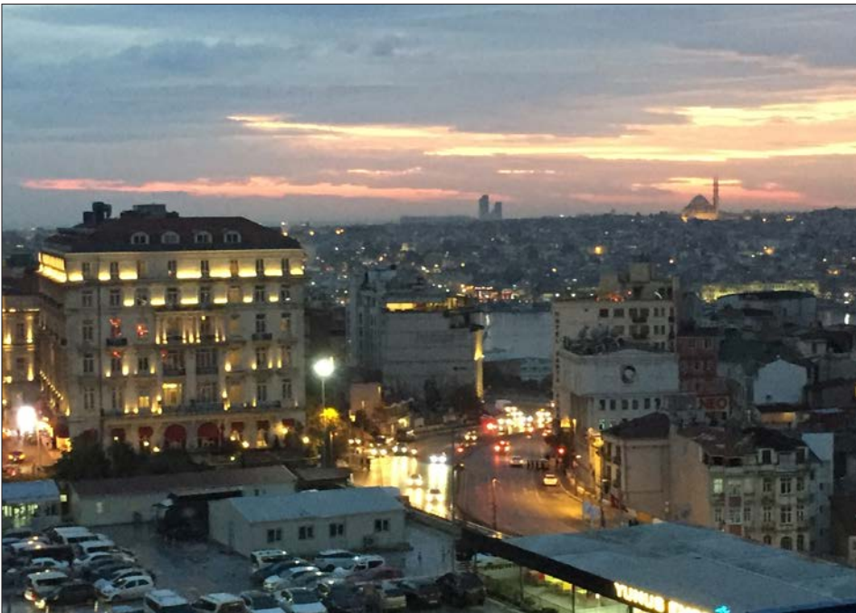
View from the Istanbul ARIT Annex: Pera Palas on left, Fatih Camii on right.

Tel: +90 (212) 257-8111 E-Mail: bdjohnson62@gmail.com