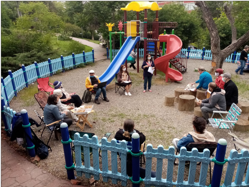
Figure 11: Meeting of the Ankara branch of the Türk Amerikan İlmi Araştırmalar Derneği at the Basın Şehitleri Parkı near the Ankara ARIT office.