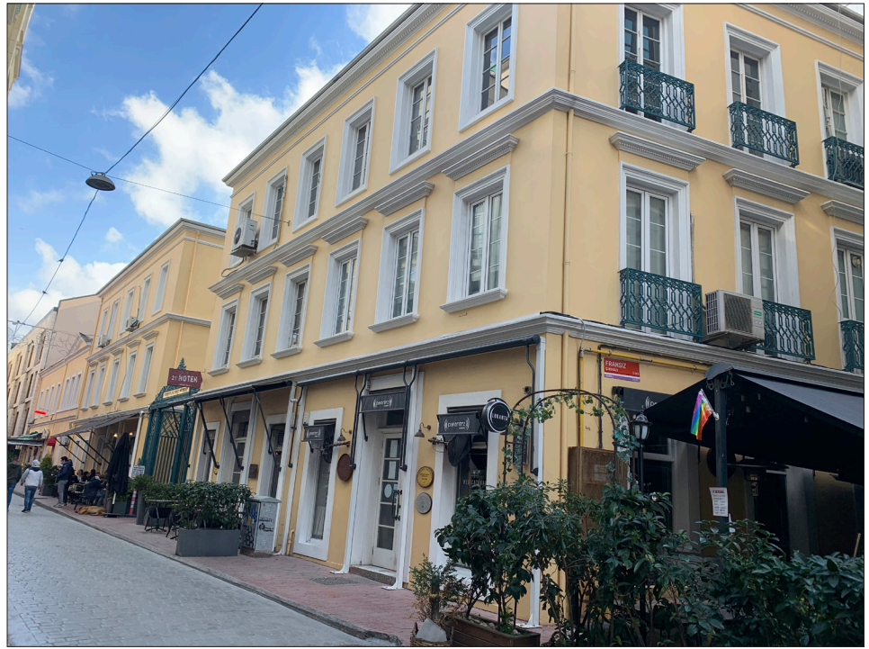
Figure 3: Street View of Fransız Geçidi İş Merkezi in Karaköy.

The work on the Feriköy Protestant Cemetery this past year was perhaps the most active since the inception of the Initiative in 2018. Now consisting of six academic research centers (ARIT,