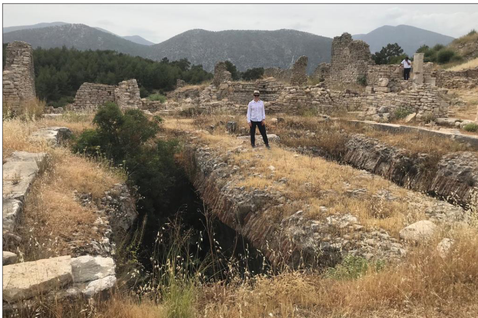
Figure 16: Investigating the medical complex at Rhodiapolis was the primary objective of my project at this site. Rainwater was collected in a series of massive cisterns that lay underneath the artificially constructed terraces. The city was built on top of the cisterns, which were so large that in this photo only the top of a mature tree growing inside one of them is visible.