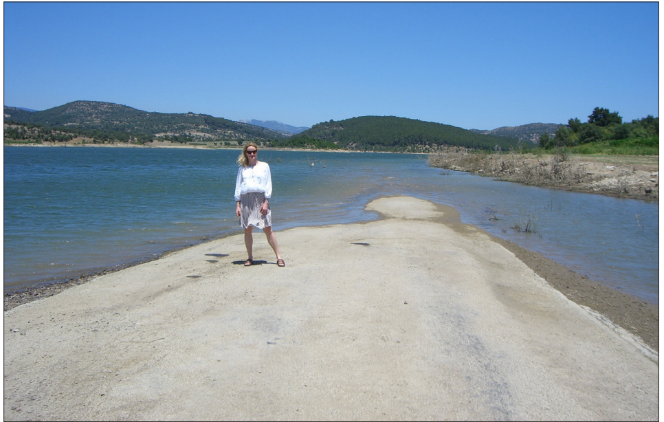
Figure 14: We followed the road to Allianoi as far as we could before it disappeared under the water of the lake that was created by the Yortlanı dam.

we know of only six significant sites from the Imperial period that are associated with Graeco-Roman medicine outside of martial, sacred, or burial contexts; Allianoi and Rhodiapolis are two of these. The objective of my project was to examine the evidence from these two extraordinary sites and shed further light on our knowledge of Graeco-Roman