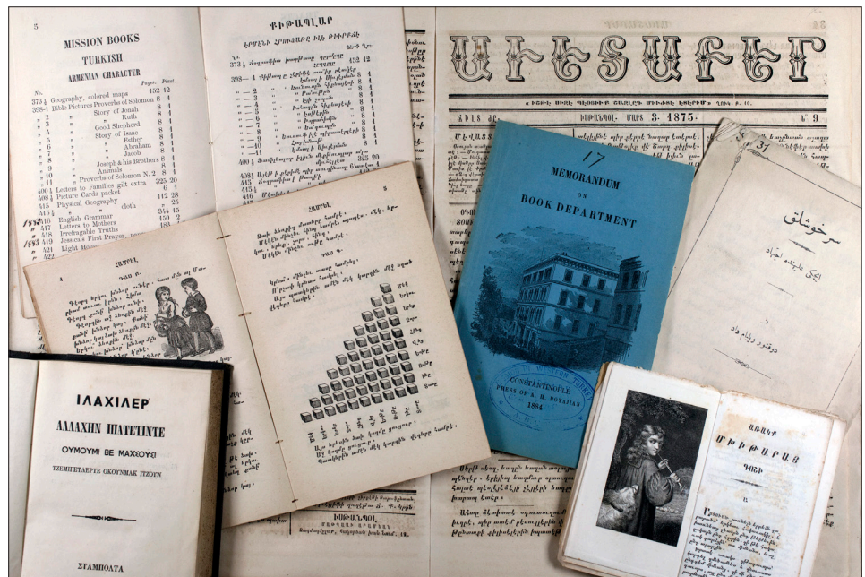
Figure 4: American Board Periodical and Pamphlet Collection.

BIAA, Hungarian Cultural Center, NIT, Orient-Institute Istanbul and SRIT), the Feriköy Protestant Cemetery Initiative published this year the German and Turkish translations of the visitor’s guide that initially appeared in English.