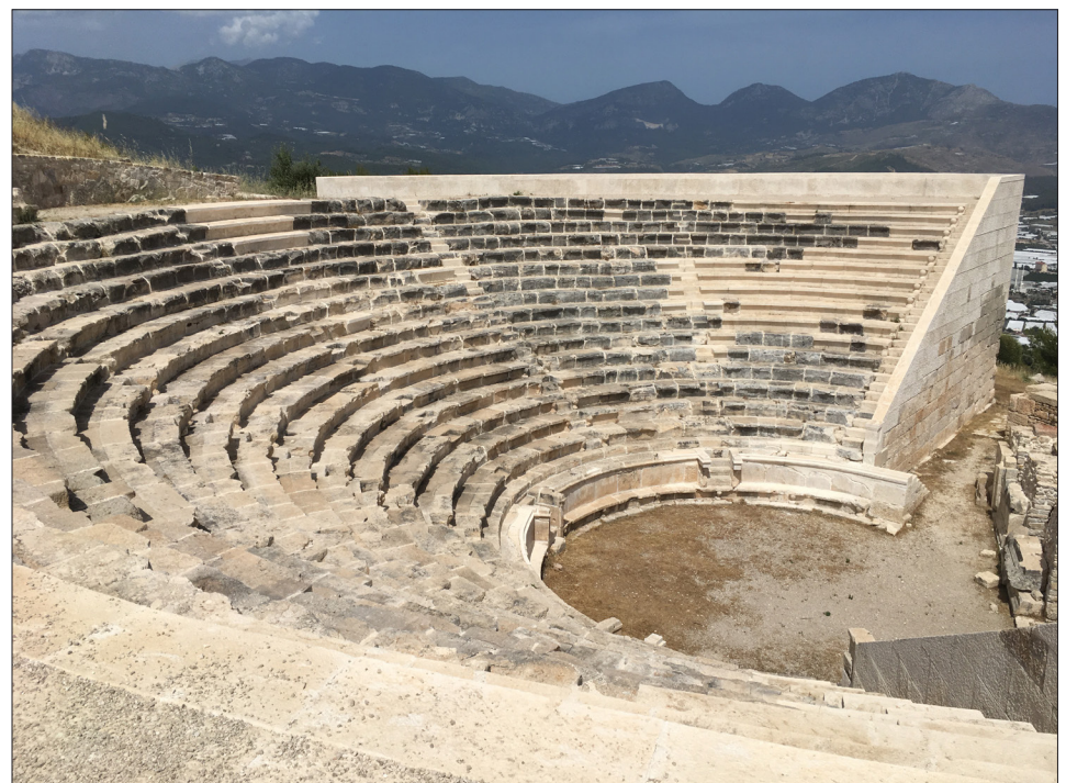
Figure 15: The magnificent theater of Rhodiapolis.