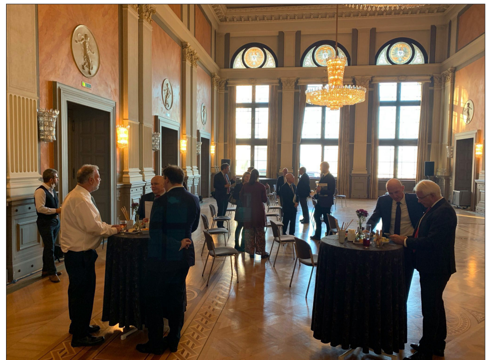
Figure 9: Reception at the Consulate General of Germany for the Initiative and Diplomatic Governing Board members.

https://aritweb.org/fellowships/arit-summer-fellowships-turkish/